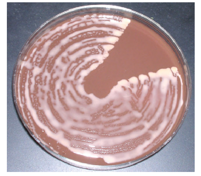
Figure 2. Colonies on chocolate agar plate.

mucoid, irregular, salmon-pink to red colonies after 2-7 days of incubation ( Figure 2 ). Phenotype-based misidentification as Corynebacterium sp. has been obtained by using automated methods for typing. Finally, acid-fast staining cannot discriminate the organism from mycobacteria.<sup>7,9,12-15</sup>