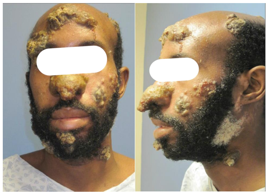
Figures 1 and 2. There are several large one to two inch, discrete, yellowish-brown, necrotic crusted malodorous verucous plaques and tumors.