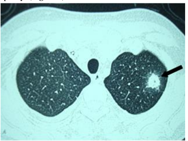
Figure 1: Axial CT chest showing left upper lobe consolidation with surrounding ground glass opacity (shown by arrow).

days (day -6 and day -5). The CD34+ cell dose given was 4.8x10<sup>6</sup>/kg. Graft versus host disease (GVHD) prophylaxis included horse anti-thymocyte globulin (ATGAM® Pfizer) 30mg/kg/day for 4 days (day -4 to day -1), methotrexate (10\text{mg/m}^2) on day+1, +3 and +6, and cyclosporine 100mg twice daily intravenously from day -1 with dose adjusted according to plasma cyclosporine levels (between 150-300ng/ml). She was given oral levofloxacin 500mg daily, fluconazole 400mg daily, aciclovir 400mg twice daily and trimethoprim-sulfamethoxazole 480 mg q12 hours on alternate days as prophylaxis. She developed fever on day +4 of transplant and was started on piperacillin plus tazobactum (4.5g i.v. q 6 hours) and amikacin (750mg i.v. q 24 hours). Chest radiograph was normal, and blood and urine cultures were sterile. She became afebrile on day +7. She engrafted on day +10 (absolute neutrophil count >0.5x10<sup>9</sup>/l and unsupported platelet count > 20x10^9/1 ). On day + 17 she developed fever with dry cough and left sided chest pain. Computerized tomography (CT) scan of the chest showed left upper lobe consolidation with surrounding ground glass opacity. (Figure 1)