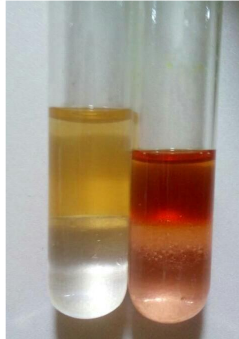
Figure 1. Urine showing mild increase in porphobilinogen( Hoesch test) and partitioning with chloroform in urine of the patient (ruby red color).

immunoglobulins including IgD levels were normal. Ultrasound examination of abdomen and pelvis, CT scan with contrast and MRI scan of chest and abdomen was essentially normal.