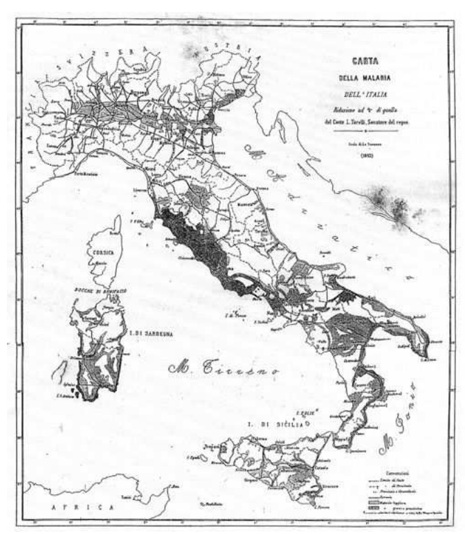
Figure 1. Map of malaria distribution in Italy. Torelli, Firenze, Pellas, 1882. (Reprinted from: Il Laboratorio di Malariologia . A cura di Giancarlo Majori e Federica Napolitani. Roma: Istituto Superiore di Sanità; 2010. (I beni storico-scientifici dell'Istituto Superiore di Sanità, Quaderno 5).

low Veneto, Tuscany (Maremma), Southern provinces, and the Islands of Sardinia and Sicily. In the North there was the absolute presence of benign tertian and quartan malaria. About 2 million hectares of land were not cultivated because of malaria, especially in the areas mentioned above.