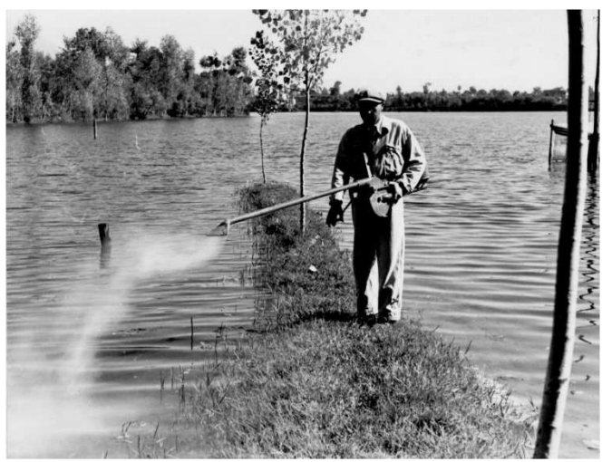
Figure 4. Spraying of "Paris Green". Ceprano, Central Italy, 1939. (Reprinted from: Il Laboratorio di Malariologia . A cura di Giancarlo Majori e Federica Napolitani. Roma: Istituto Superiore di Sanità; 2010. (I beni storico-scientifici dell'Istituto Superiore di Sanità, Quaderno 5).

6 weeks.<sup>13</sup> The reduction in the length of treatment was a success in terms of compliance and clinical effects. Thus, all the Experimental Stations created by the Rockefeller Foundation in Southern Europe adopted, with minor variations, the "short-course treatment" also known as "Yorke's treatment'. In 1933 the Commission of Experts of the Society of Nations recommended that treatment with quinine in any type of malaria should have been administered in not more than a week.<sup>13</sup>