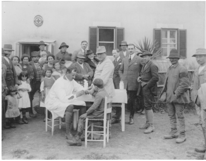
Figure 2. Blood collection for malaria diagnosis in rural population of Nettuno, Roma, 1920.

In Italy, the reduction of malaria endemicity registered during the same period was mainly due to the approval of laws of great social importance. The most important act of the Italian Parliament was the approval of the law regulating the production and free distribution of quinine, followed by the promotion of measures aiming at the reduction of the larval breeding places of Anopheline vectors. Since 1898, especially because of the great political and social commitment of