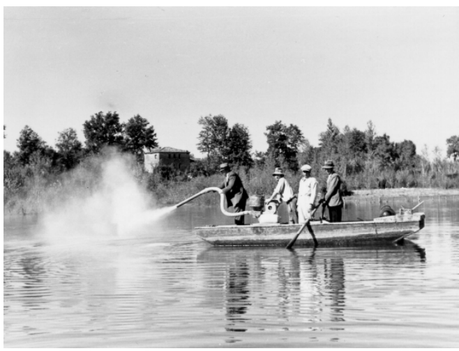
Figure 5. Spraying of "Paris Green" on boat. Ceprano, Central Italy, 1939. (Reprinted from: Il Laboratorio di Malariologia . A cura di Giancarlo Majori e Federica Napolitani. Roma: Istituto Superiore di Sanità; 2010. (I beni storico-scientifici dell'Istituto Superiore di Sanità, Quaderno 5).

The Institute of Malariology «Ettore Marchiafava»: origin and functions. The Institute "Ettore Marchiafava" was born as the transformation of the Superior School of Malariology, established in Rome in 1925 as an output of the aforementioned international Congress of malaria. The School was established with the aim of "Promoting studies and