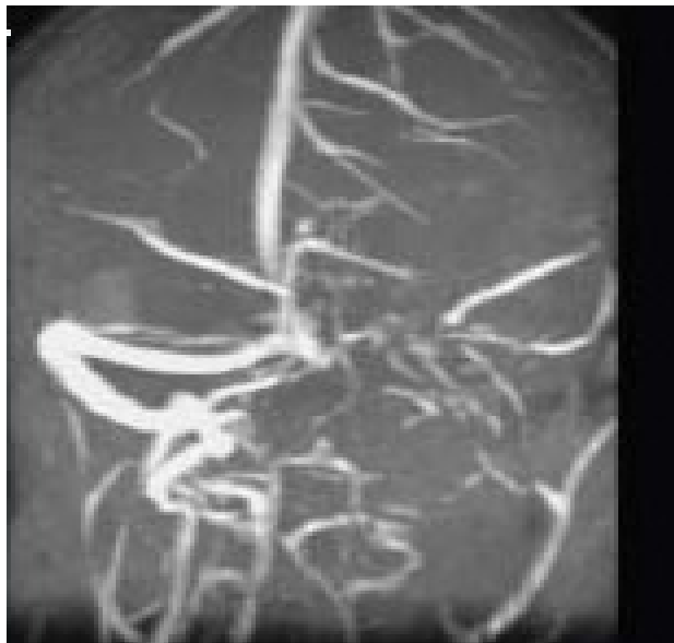
Figure 2: Cranial MRV- demonstrating occlusion of the left transverse and sigmoid sinuses.

risk factors remains to be elucidated. 1-5,10-12,29-30 Trauma, infections (especially sinusitis, mastoiditis and other conditions affecting the head and neck area), collagen vascular disorders, hemoglobinopathies, metabolic and inflammatory bowel diseases have been suggested as potential risk factors for CSVT occurrence in small cohort and case study series. 31-38 Several case-control studies have dealt with the role of prothrombotic risk factors in the pathophysiology of CSVT. 1-5,10-12,39-44 In a recent meta-analysis of pediatric case-controlled studies thrombophilia certainly increased the risk of stroke or CSVT in patients aged 0-18 years old, especially when combination of thrombophilic risk factors was diagnosed. 45 A statistically significant association with first event