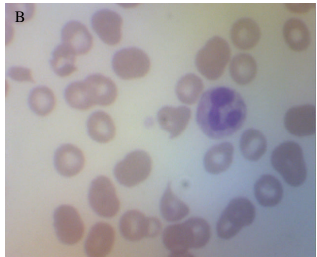
Figure 2. H+E stained peripheral blood smear showing shistocytes, 100X power. (a) POD (post-operative day) #3, (b) POD#4.

MAHA. In looking for specific trigger, we also asked the question as to whether MAHA has been triggered by ovarian tumors.