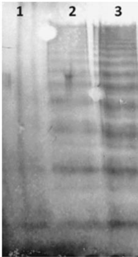
Figure 2. Multimer gel image demonstrated the presence of high molecular weight multimers.

patient. Interestingly, DDAVP was able to stimulate enough secretion of VWF from endothelial Weibel-Palade bodies to overcome the clearance of VWF by the autoantibody, resulting in normalization of VWF:Ag and VWF:Act levels, and reappearance of HMW multimers. The decrease (but still abnormal) VWFpp:Ag ratio (5.3) also reflects the increased secretion stimulated by DDAVP relative to clearance that remained constant. VWFpp is cleaved in the trans-Golgi but remains stored together with mature VWF in platelet \alpha -granules and endothelial cell Weibel-Palade bodies in equimolar amounts. After release, VWFpp dissociates from the mature VWF subunit, circulates with a steady-state half-life, and serves as a marker of VWF secretion. 10 A high VWF:pp/Ag ratio has been proposed by Scott et al., 11 as a simple method to distinguish AVWS due to decreased VWF synthesis from that due to increased clearance. Federici et al. 8 characterized in their paper some differences in AVWS caused by IgG-MGUS versus IgM MGUS. Although the paper reported on only 8 IgG-MGUS and 2 IgM MGUS, they reported a higher vWF:pp/Ag compared to controls in IgG MGUS but not in IgM MGUS. In addition, a normal multimeric pattern was seen in the IgG MGUS cases but