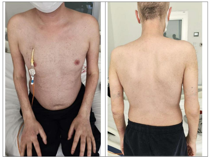
Figure 3. The images presented here show the results of a four-week treatment period.

Discussion. In the absence of accompanying extracutaneous manifestations, establishing a definite diagnosis of acute cutaneous GVHD may prove challenging. The clinical picture of acute cutaneous GvHD is non-specific and may prove challenging to