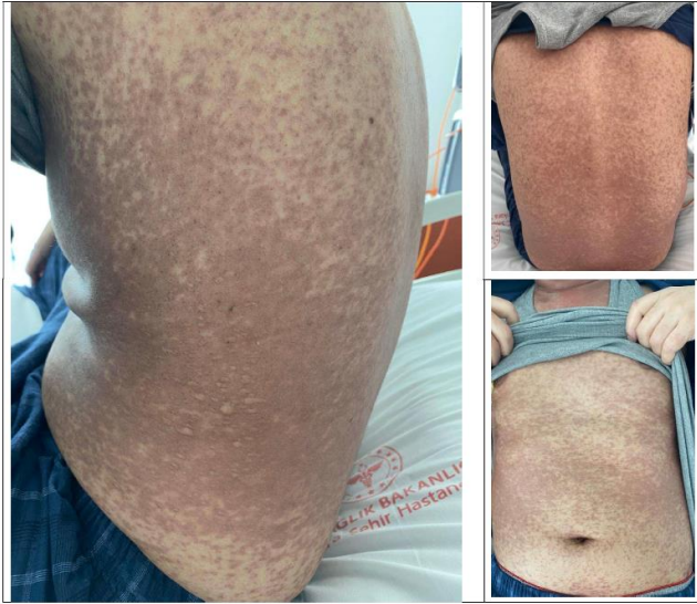
Figure 1. The patient presented with cutaneous lesions, particularly vesiculobullous eruptions affecting the flank region, as illustrated in the photograph.